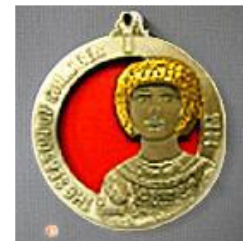
2004 – Takusket 6 th in the series