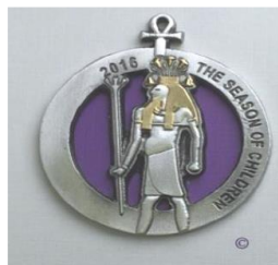
2016 – Hapi 18 th in the series