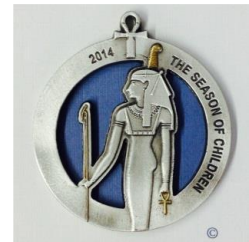
2014 – Maat 16 th in the series