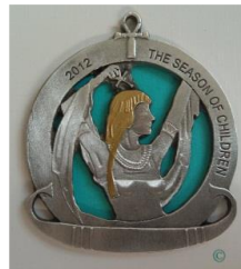
2012 – Cleopatra 14 th in the series