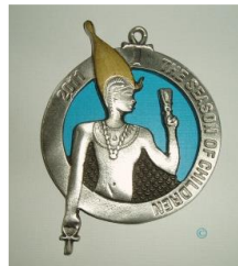
2011 – Ihy 13 th in the series