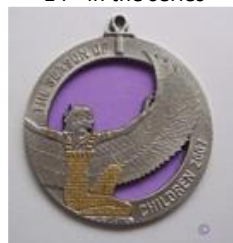
2007 – Isis 9 th in the series