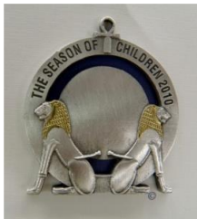
2010 – Aker 12 th in the series