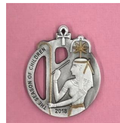
2018-Seshat 20 th in the series