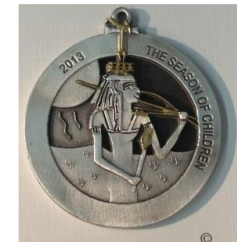
2013 – Wosret 15 th in the series