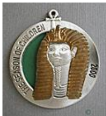
2000 – King Tut 2 nd in the series