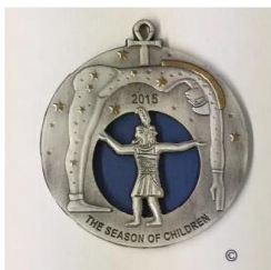
2015 – Nuit 17 th in the series