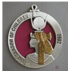
2002 – Hathor 4 th in the series