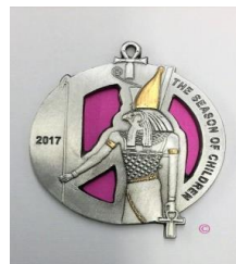
2017 – Horus 19 th in the series