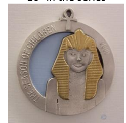
2009 – Hatasu 11 th in the series