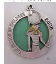
2008 – Ra 10 th in the series