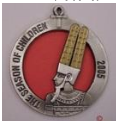
2005 – Amun 7 th in the series