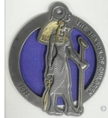
2022 - Sekhmet 24 th in the series