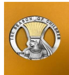
2019-Anuket 21 st in the series