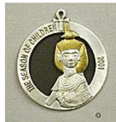
2001 – Selket 3 rd in the series