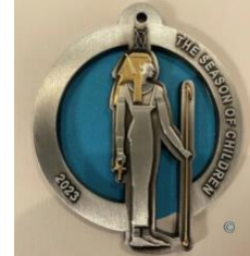
2023 - Hemsut 25 th in the Series