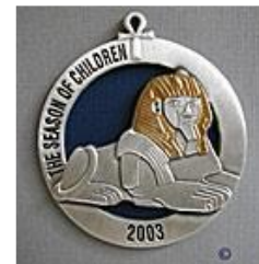
2003 – Sphinx 5 th in the series