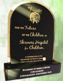
Giving For the Future