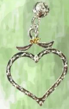
Gift of Love - Earrings -