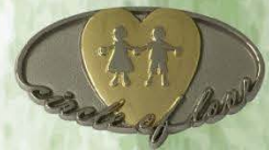
Circle of Love - Pin -