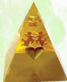
Pyramid of Commitment