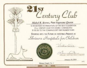
21st Century Club Certificate