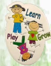
Happy Kids Pin 2018