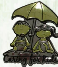
Beach Pin 2017