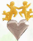
Children on Heart - Pin -