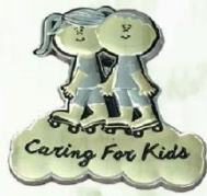
Skates Pin 2016