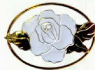
Pristine Rose - Pin -