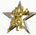
Reach For The Stars - Pin -