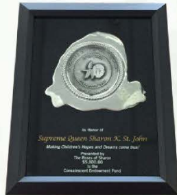
Hopes & Dreams