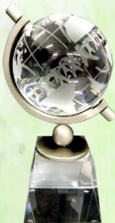
Serving Children Around the World