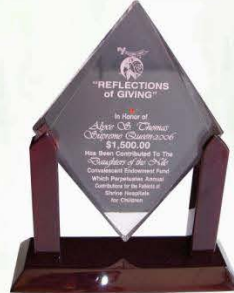
Reflection of Giving