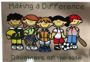
Making a Difference Lucite