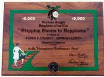
Stepping Stones to Happiness