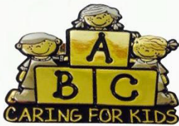
ABC Blocks 2015