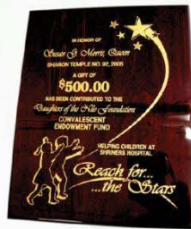
Reach For The Stars