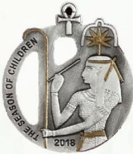
Seshat Ornament 2018