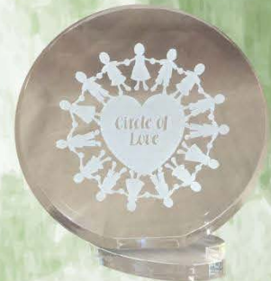
Circle of Love Lucite