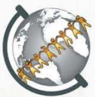
Serving Children Around the World - Pin -